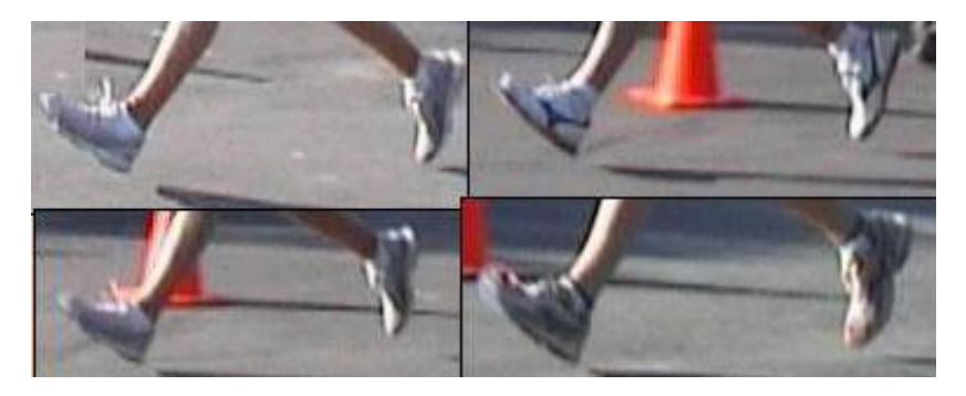
Figure 3: Loss of Contact – both feet off the ground at the same time. The rear leg has left the ground, before the advancing leg has made contact with the ground.