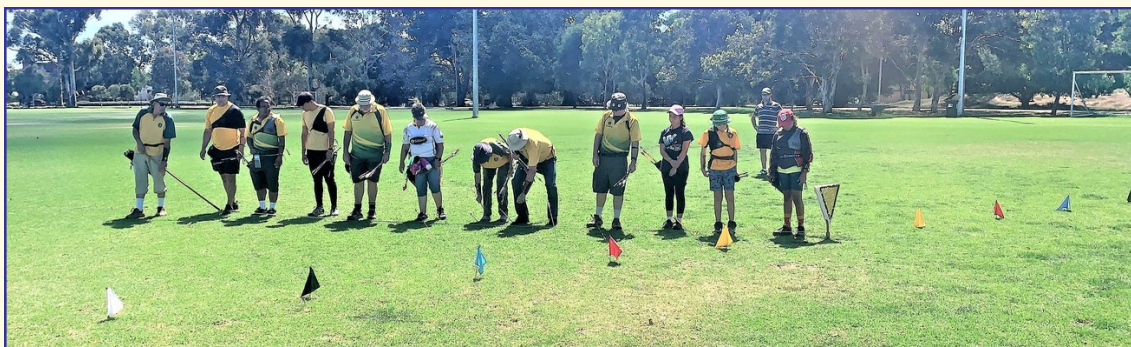
Collecting arrows that have scored on the target