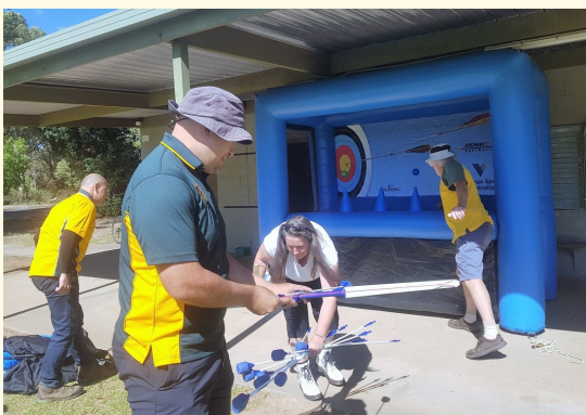
Setting up and testing one of the Vets Day activities