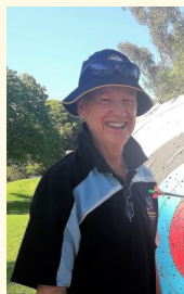
AAC members at the Christine Player Tournament in Port Pirie