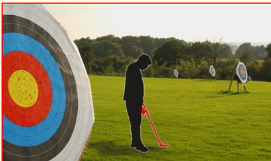
Use Hector the metal detector to find aluminium arrows

IF YOU HAVE, YOU MUST RECORD IT IN THE CLUB'S (NEW) LOST ARROW REGISTER. THE REGISTER IS IN THE OUTSIDE CUPBOARD HOUSING THE PRACTICE TARGETS.