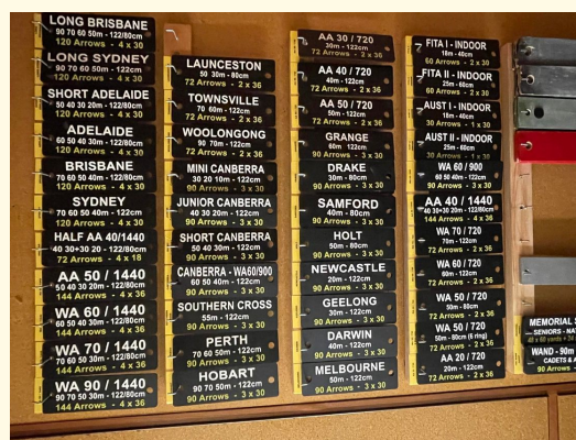
The new plaques for the sign-up board.