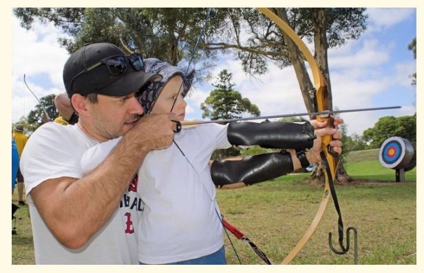
Dad helped out this little guy