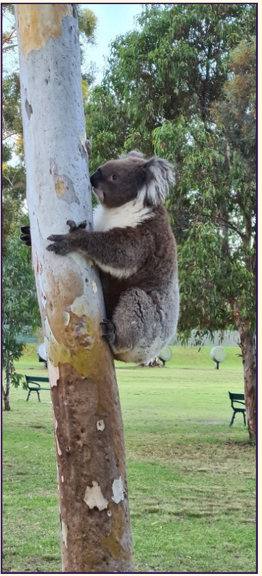
This koala visited the AJADs. Who knew that they live in the Parklands?