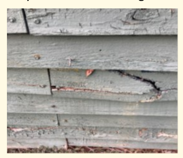
The fence behind the targets is rapidly deteriorating

It may also mean that the grounds may not be available for some periods so the painting and fixing can be done safely.