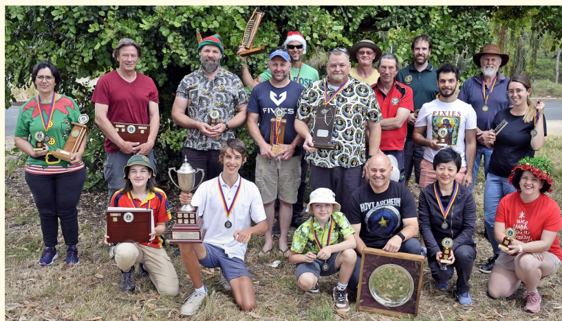
2022 Trophy winners