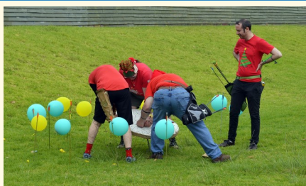
Some of the challenging 'targets'