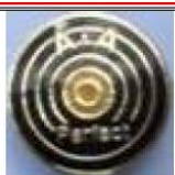
Field Perfect Pin

Field Perfect Pin: For a FITA Field Round where the 3 arrows on the one target are all in the 6 ring scoring 18 points. Both Medallions are available to purchase at club level. The cost of these awards is $6.00 each