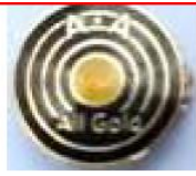
Field All Gold Pin