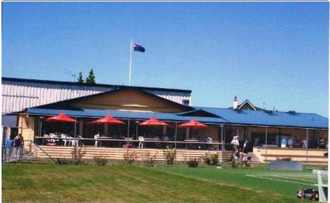
HAWKES BAY LAWN TENNIS CLUB

THE EVENT in 2020 will be hosted by Tennis Seniors Hawkes Bay The Tennis New Zealand Seniors 2020 National Teams Event is a Team Competition for Men and Women from 35+ to 75+ years of age.