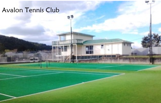
Avalon Tennis Club