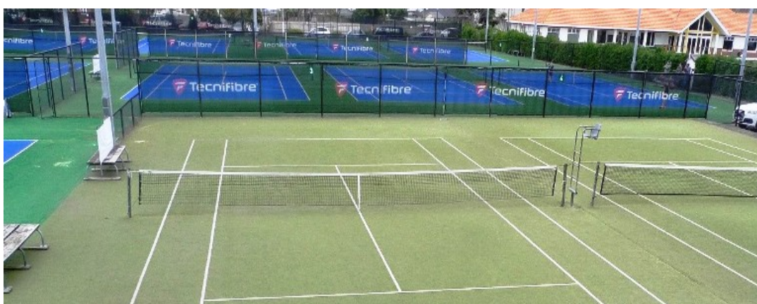
Mitchell Park Racquets Club, Hutt Valley

THE EVENT in 2018 will be hosted by Kapi Mana Veterans Tennis Club