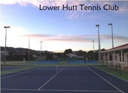
Lower Hutt Tennis Club