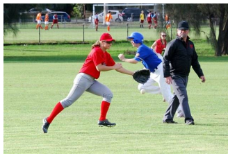
First Double Play - Part 1