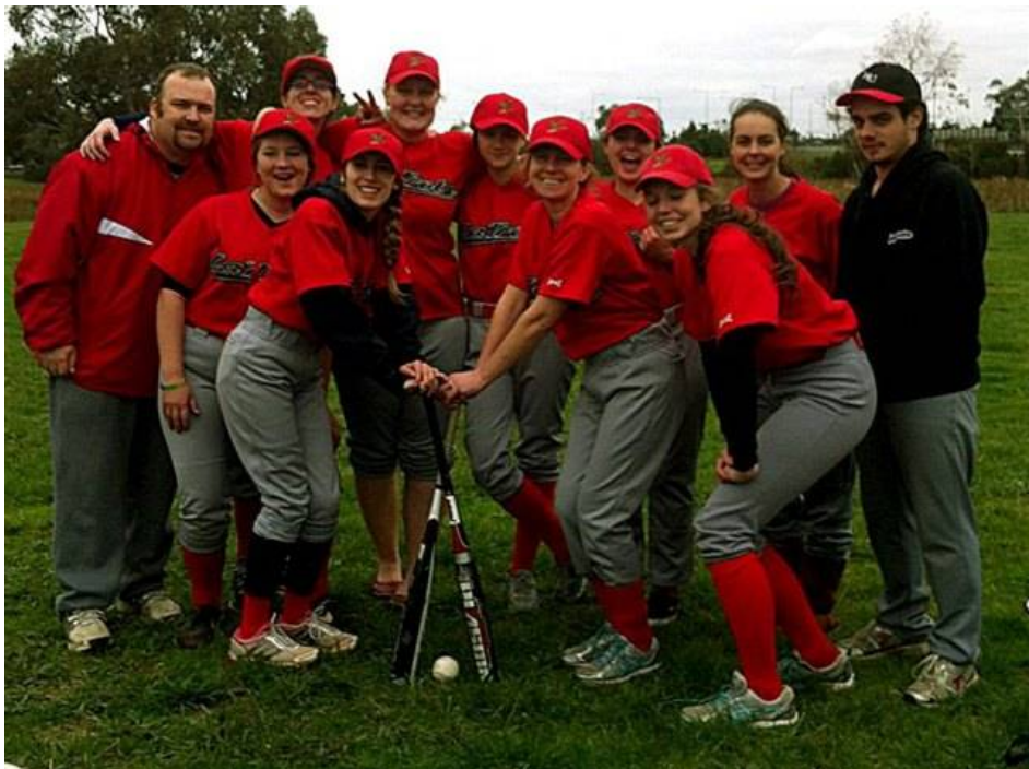
Womens Team - First Win