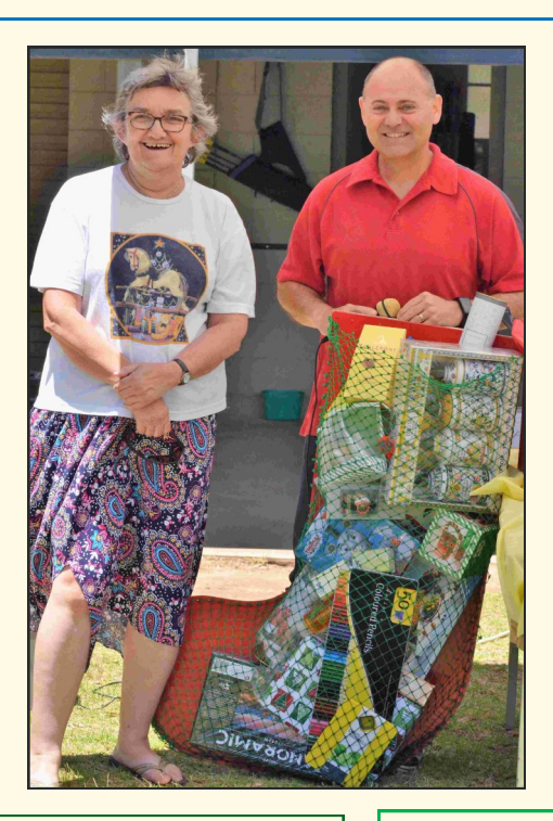
Adelaide Archery Club Inc. Bundeys Road & War Memorial Drive North Adelaide 5006 PO Box 133, Walkerville, SA 5081

News, letters, comments and photographs are all welcomed by the editor